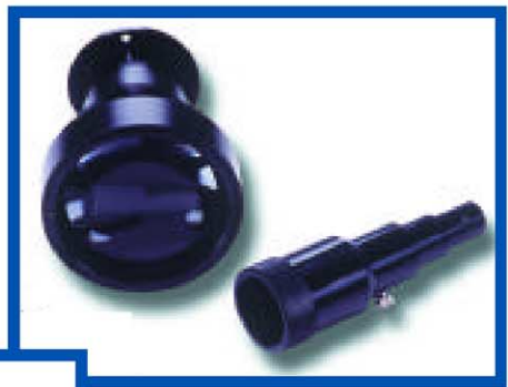
Small Area High Uniformity Exposure Lenses

Used for horizontal scanning and edge curing.