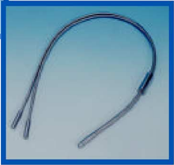
Quartz Bifurcated LightGuide

The quartz accessories we offer are of superior quality. Useful for deep UV & high intensity applications.