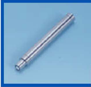
Single Core Quartz Rigid Light Pipe

The quartz accessories we offer are of superior quality. Useful for deep UV & high intensity applications.